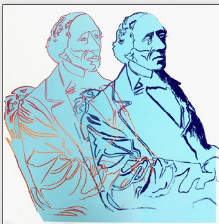
Andy Warhol (1928–1987), "Hans Christian Andersen," 1987, Screenprint. Extra, out of the edition. Designated for research and educational purposes only.