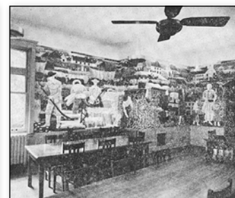
The only known photo of the murals in situ at Wheeler Hall.