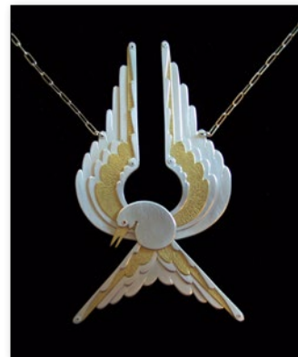
"Spirit Bird," necklace, 2011