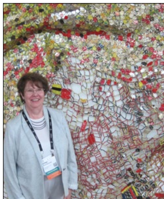
Me at the Bill and Melinda Gates Foundation in Seattle. I am standing in front of a spectacular tapestry made of metal bottle tops by Ghanaian artist El Anatsui during a reception for museum CEOs at the AAM conference.

Director of the University Museum/Museum Studies Program