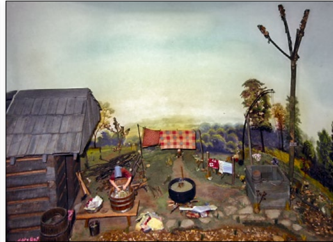
WPA diorama, "Wash Day"

Set design model for "Pirates of Penzance" by Darwin Payne.