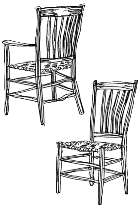
Drake arm and side chairs by Rory Jaros

The exhibit continues through November 14.