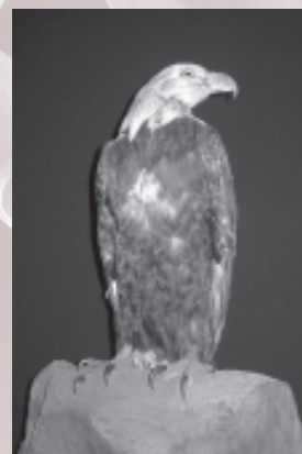
Taxidermied birds on loan from the SIUC Department of Zoology