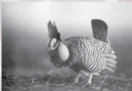
"Prairie Chicken, Newton, Illinois," Tom Ulrich

Once Upon A Frame: Wildlife Photographs by Tom Ulrich